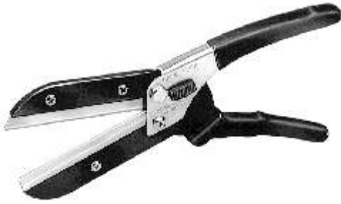
15748 Moulding Cutting Tool

A professional quality tool that cuts with absolute accuracy every time to give a clean, accurate and precise edge. The 15748 tool features a replaceable razor-sharp blade cutting against a plastic anvil which is also replaceable. Excellent for cutting rubber/plastic moulding (up to 3-1/2"), weatherstrip, carpeting and most flexible materials. The tool measures 10" overall and the handles are vinyl coated.