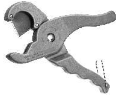
20900 Hose Cutter

Razor sharp blade cleanly cuts heater hoses, fuel line hoses and any other type of flexible hose up to 1-1/4" diameter: The stainless steel blade is reversible for double the life. The pliers are made of glass-filled gray nylon for strength. Includes a locking hoop for safe storage. Overall length: 9-1/2".