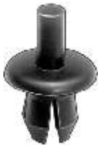
19195 (161-867-299-01C) Black Nylon

Push-Type Retainer Head Diameter: 16mm Stem Length: 12mm Fits Into 8mm Hole VW Golf & Jetta 1997-93