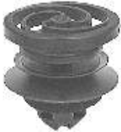
20341 (3B0-868-243) Black Nylon

Door Trim Panel Retainer Head Diameter: 22mm Stem Length: 10mm Fits Into 10mm Hole Beetle, Golf, Jetta & Passat 1998 - On