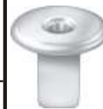
14273 (90189-06005) White Nylon

Screw Grommet #14 (1/4") Or M6.3-1.81 Screw Size Head Diameter: 18mm Stem Length: 16mm Fits Into 8mm x 8mm Hole Lexus & Toyota