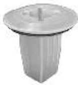
19505 (90189-06029, 90189-06084, 90189-06116) Natural Nylon

Rear Door Panel Screw Grommet #12 Screw Size Head Diameter: 18mm Stem Length: 17mm Fits Into 9mm x 9mm Hole Camry & Previa 1988 - On