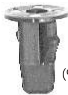
19756 (90189-06214) Black Nylon

Fender Liner Screw Grommet #12 (M5.5) Screw Size Head Diameter: 16mm Stem Length: 18mm Sienna, Tacoma & Tundra Pick-Up 1999 - On