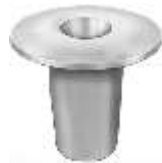
19742 (90189-06104) Natural Nylon

Fender Lining Screw Grommet #12 (M5.5) Screw Size Head Diameter: 18mm Stem Length: 15mm Fits Into a 9mm Square Hole Lexus IS300 & Toyota Avalon, Camry & Sienna 1997-On