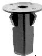
19721 (90189-06157) Black Nylon

Fender Lining Screw Grommet #12 Screw Size Head Diameter: 20mm Stem Length: 22mm Fits Into 8mm x 8mm Hole Avalon, Camry, Rav 4, Solara & Tacoma 1995-On