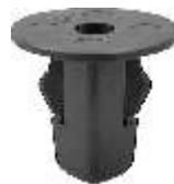
20440 (90189-06065) Black Nylon

Hood & Fender Screw Grommet M5.5 (#12) Screw Size Head Diameter: 20mm Stem Length: 18mm Fits Into 9mm x 9mm Hole Camry & RAV 4 1999 - 95