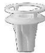
20412 (90189-06114) White Nylon

Front Fender Liner Screw Grommet Use With M5.5 (#12) Screw Head Dia: 18mm Stem Length: 15mm Fits Into 9mm Sq. Hole RAV 4 1996 - On