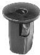
19194 (Toyota: 90189-06028; GM: 94854203) Black Nylon

Front & Rear Wheel Fender Liner Screw Grommet #12 Screw Size Head Diameter: 16mm Stem Length: 19mm Fits Into 9mm x 9mm Hole Tacoma, T100 & 4 Runner 1992-On Chevrolet Nova & Prizm And Pontiac Vibe 1985-On