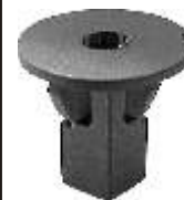
14267 (90189-06013) Black Nylon

Screw Grommet #14 (1/4") Or M6.3-1.81 Screw Size Head Diameter: 20mm Stem Length: 17mm Fits Into 8mm x 8mm Hole Lexus & Toyota