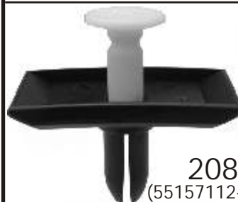
20890 (55157112-AA, -AB) Black & Natural Nylon Bumper Cover Push-Type Retainer Head Size: 25mm x 45mm Shoulder Length: 3mm Stem Length: 20mm Fits Into 9.5mm Hole Jeep Liberty 2005 - On UNIT PACKAGE: 15