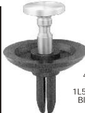
19638 (Chrys: 4805405AA; Ford: 1L5Z-17K826AA) Black & White Nylon Front Bumper Fascia Push-Type Retainer Head Dia.: 34mm Stem Length: 20mm Fits Into 8mm Hole Concorde, Intrepid, Eagle Pacifica & PT Cruiser 1998-On Ford Trucks 2005-On UNIT PACKAGE: 15