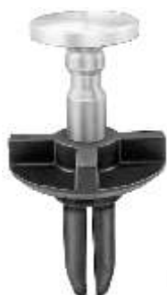
20767 (4806110-AA) Black & White Nylon Front Bumper Push-Type Retainer Head Diameter: 24mm Shoulder Length: 3mm Stem Length: 20mm Fits Into 11mm Hole Chrysler 300 & Dodge Magnum 2005 - On UNIT PACKAGE: 15