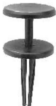
18269 (6503106) Black Nylon Lower Sill Moulding Push-Type Retainer Large Head Dia.: 7/8" Stem Length: 1" Fits Into 1/4" Hole Jeep Grand Cherokee Laredo 1994-On UNIT PACKAGE: 15