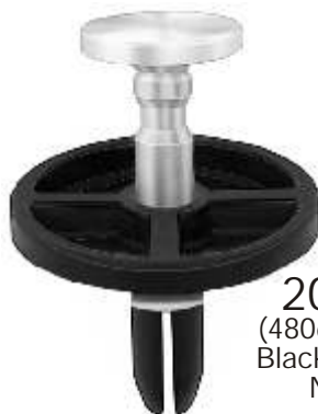
20963 (4806334-AA) Black & White Nylon Rear Bumper Push-Type Retainer With Sealer Head Diameter: 34mm Shoulder Length: 3.5mm Stem Length: 17mm Fits Into 8.5mm Hole Dodge Caliber and Jeep Compass & Patriot 2007 - On UNIT PACKAGE: 10