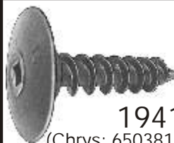
19417 (Chrys: 6503819, 6503401; GM: 25631448) Black Nylon M7.5 x 35mm Square Drive Truss Head 22mm Head Diameter 9mm Shoulder Diameter Foam To Bumper Fascia Chrysler 1993 - On GM 1997 - On UNIT PACKAGE: 15