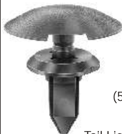
20940 (55157330-AC) Black Nylon Tail Light Push-Type Retainer Large Head Diameter: 31mm Small Head Diameter: 20mm Stem Length: 21mm Fits Into 8mm Square Hole Jeep Commander 2006 - On UNIT PACKAGE: 15