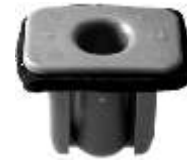
20947 (11561382, 11610198) Blue Nylon

#12-28 x 1-11/16" Headlight Adjusting Screw & Nut Assembly Chevrolet, Oldsmobile & Pontiac 1975-On UNIT PACKAGE: 10