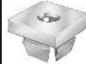
9851 (3921446) White Nylon

Headlight Adjuster Pivot Fits Into 13mm Square Hole Regal, Concours, Eldorado, Seville, Caprice, Lumina, Full-Size Van, Cutlass, Grand Am & Grand Prix 1987 - On UNIT PACKAGE: 25