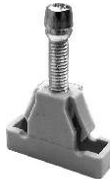
11871 (559312) Nylon

#12-28 x 1-3/4" Headlight Adjusting Screw & Nut Assembly Camaro & Firebird 1975-On UNIT PACKAGE: 10