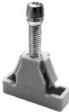
11667 (556539) Nylon

#12-28 x 1-3/4" Headlight Adjusting Screw & Nut Assembly Buick & Oldsmobile 1977-On UNIT PACKAGE: 25