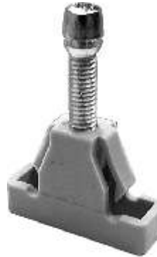
12605 (22512857, 22513813) Nylon

Call Our Customer Service Department When You Need A Sample...