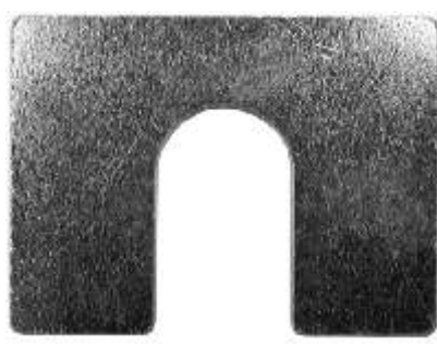
2" x 1-1/2" w/ 5/8" Slot Zinc