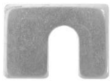
1-3/4" x 1-1/4" w/ 1/2" Slot Zinc

3155 1/16" Thick UNIT PKG: 100 3156 1/8" Thick UNIT PKG: 100