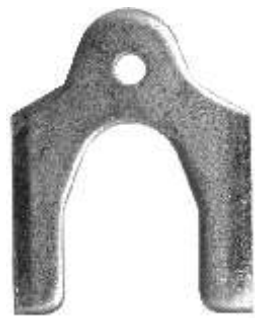
1-3/16" x 1-15/32"