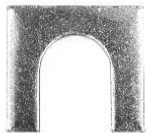
1-3/8" x 1-1/4" w/ 5/8" Slot Zinc

20322 1/8" Thick UNIT PKG: 50 20323 3/16" Thick UNIT PKG: 25