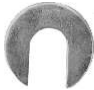
15/16" O.D. w/ 3/8" Slot Zinc

20322 1/8" Thick UNIT PKG: 50 20323 3/16" Thick UNIT PKG: 25