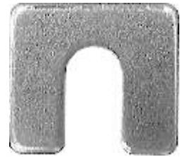
1-1/4" x 1-1/8" w/ 3/8" Slot Zinc

3155 1/16" Thick UNIT PKG: 100 3156 1/8" Thick UNIT PKG: 100