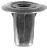
19742 (90189-06104) Natural Nylon

Fender Lining Screw Grommet #12 (M5.5) Screw Size Head Diameter: 18mm Stem Length: 15mm Fits Into a 9mm Square Hole Lexus IS300 & Toyota Avalon, Camry & Sienna 1997-On