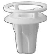
20412 (90189-06114) White Nylon

Front Fender Liner Screw Grommet Use With M5.5 (#12) Screw Head Dia: 18mm Stem Length: 15mm Fits Into 9mm Sq. Hole RAV 4 1996 - On