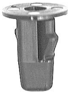
19756 (90189-06214) Black Nylon

Fender Liner Screw Grommet #12 (M5.5) Screw Size Head Diameter: 16mm Stem Length: 18mm Sienna, Tacoma & Tundra Pick-Up 1999 - On