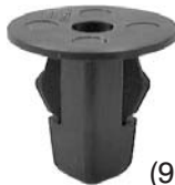
20440 (90189-06065) Black Nylon

Hood & Fender Screw Grommet M5.5 (#12) Screw Size Head Diameter: 20mm Stem Length: 18mm Fits Into 9mm x 9mm Hole Camry & RAV 4 1999 - 95