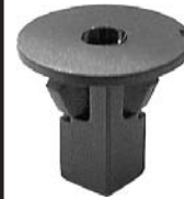
14267 (90189-06013) Black Nylon

Screw Grommet #14 (1/4") Or M6.3-1.81 Screw Size Head Diameter: 20mm Stem Length: 17mm Fits Into 8mm x 8mm Hole Lexus & Toyota