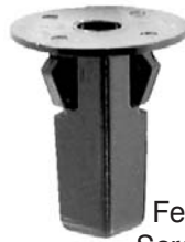
19721 (90189-06157) Black Nylon

Fender Lining Screw Grommet #12 Screw Size Head Diameter: 20mm Stem Length: 22mm Fits Into 8mm x 8mm Hole Avalon, Camry, Rav 4, Solara & Tacoma 1995-On