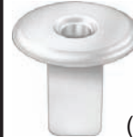
14273 (90189-06005) White Nylon

Screw Grommet #14 (1/4") Or M6.3-1.81 Screw Size Head Diameter: 18mm Stem Length: 16mm Fits Into 8mm x 8mm Hole Lexus & Toyota