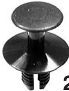
20638 (201-990-02-92) Black Nylon

Push-Type Retainer Head Diameter: 20mm Stem Length: 9mm Fits Into 8mm Hole UNIT PACKAGE: 10