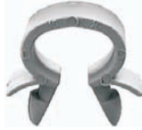
20653 Gray Nylon

Rear Compartment Carpet Retainer Fits Onto 5mm Stud Head Diameter: 24mm 10mm Hex UNIT PACKAGE: 25