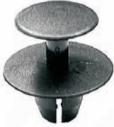
20637 (123-990-02-92) Black Nylon

Push-Type Retainer Head Diameter: 12mm Stem Length: 10mm Fits Into 8.5mm Hole UNIT PACKAGE: 15