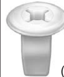
14695 (Honda: 90661-SC7-0030; Mazda: H001-50-841; Mitsubishi: MS-480012; Nissan: 01651-00481, 01651-00481, 74798-S9000; Toyota: 90189-06042) White Nylon

Screw Grommet #8 Screw Size Head Diameter: 16mm Stem Length: 17mm Fits Into 8mm x 8mm Hole