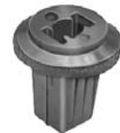
20303 (90664-SB3-003) Natural Nylon

Trim Panel Screw Grommet #8 (M4.2) Screw Size Head Diameter: 15mm Stem Length: 15mm Fits Into 8mm x 8mm Hole Accord 1998 - On