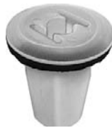
19307 (91620-SR2-003) Natural Nylon

Center Pillar Screw Grommet #4 Screw Size Del Sol 1993-On