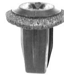
19741 (90670-SG0-003, 91626-SH3-003) Natural Nylon

Door Panel Screw Grommet #8 (M4.2) Screw Size Head Diameter: 12mm Stem Length: 16mm Fits Into 7mm x 7mm Hole Civic & CRV 1993-On