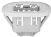
19679 (91641-SH3-013) Yellow Nylon w/ Steel Insert

Garnish Moulding Grommet Head Diameter: 14mm x 26mm Acura Integra, Honda Civic & Prelude 1988 - On