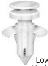
19511 (W704958-S300) White Nylon

Rear Door Lower Trim Panel Push-Type Retainer Round Head Diameter: 19/32" Wedge Shaped Head Diameter: 29/32" Stem Length: 11/16" Fits Into 3/8" Hole Lincoln Town Car 1998 - On