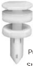
20169 (W701971-S) White Nylon

Door Trim Panel Push-Type Retainer Head Diameter: 15mm Stem Length: 13mm Fits Into 7mm Hole Lincoln LS 2000 - On