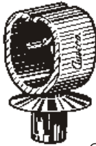
18386 (W701133-S300) Black Nylon