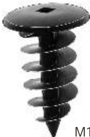
20970 Not Available From O.E.M. Black Nylon

M14 x 34mm Bumper and Door Insulator Nylon Screw 22mm Head O.D. No. 3 Square Drive Fits Into 12mm Hole GM, Ford & Chrysler 2005 - On