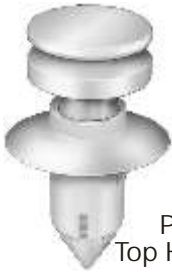
20363 Not Available From O.E.M. White Nylon

Door Trim Panel Push-Type Retainer Top Head Diameter: 15mm Bottom Head Diameter: 20mm Overall Length: 32mm Fits Into 9mm Hole Ford 2001 - On