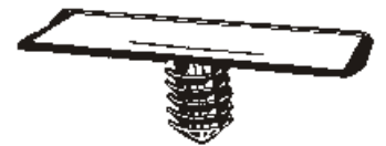
17164 (EOVY-13A506-A) Nylon

Rear Light Wiring Retainer 3/8" Wide, 1-7/16" Long Stem: 9/32" x 7/16" Long Ford 1979-On