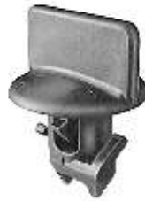
19472 (GM: 25535963; Ford: N811772S) Nylon