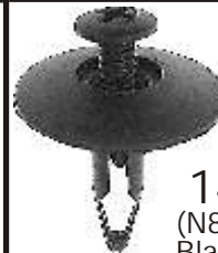
14994 (N804837S) Black Nylon

Push-Type Retainer Head Diameter: 1" Stem Length: 29/32" Fits Into 1/4" Hole Ford 1987 - On