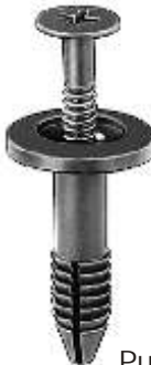
18895 (N807577-S, N808331-S) Black Nylon

Trim Panel Push-Type Retainer Head Diameter: 11/16" Stem Length: 1-3/32" Fits Into 1/4" Hole Aerostar & Windstar