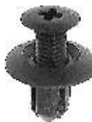
17632 (Mazda: B092-51-833; Ford: MB-455-56143) Black Nylon

Push-Type Retainer Head Diameter: 18mm Stem Length: 12mm Fits Into 8mm Hole Mazda & Ford Aspire