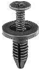
18894 (N807578-S, N808332-S) Black Nylon

Trim Panel Push-Type Retainer Head Diameter: 11/16" Stem Length: 3/4" Fits Into 1/4" Hole