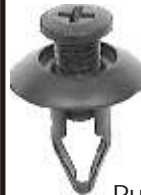
20367 (W706713-S300) Black Nylon

Bumper Cover Push-Type Retainer Head Diameter: 18mm Stem Length: 18mm Fits Into 8mm Hole Ford Escape 2001- On