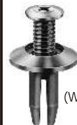
21089 (W710250-S300) Black Nylon

Rear Bumper Retainer Head Diameter: 18mm Stem Length: 18mm Fits Into 8mm Hole Edge 2007 - On