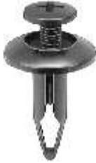
14753 (GM: 20664092; Ford: N804570S; Chry: 4638136) Black Nylon

Trim Retainer Head Dia: 11/16" Stem Length: 7/8" Fits Into 1/4" Hole Ford 1986-On Chrysler 1998 - On