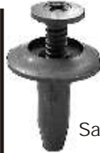
20545 (N811283-S) Black Nylon & Santoprene Rubber

Trim Panel Push-Type Retainer Head Diameter: 18mm Stem Length: 18mm Fits Into 6.3mm Hole Ford Expedition & Navigator 1997 - On