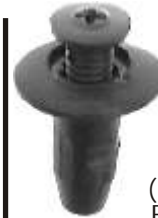
19849 (Not Available From O.E.M.)

Black Nylon & Santoprene Rubber Bumper Push-Type Retainer Head Diameter: 18mm Stem Length: 18mm Fits Into 8mm Hole Taurus & Sable 2000 - On