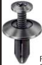
21098 (Ford: W706092-S300; Chrysler: 6508197-AA) Black Nylon

Front Air Shield, Splash Guard & Heat Shield Push-Type Retainer Head Diameter: 18mm Stem Length: 18mm Fits Into 6.4mm Hole Ford Taurus 2008 - On Dodge Ram 2006 - On