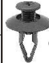
16858 (Nissan: 63844-01A00; Ford: MNA01-56145, NA01-56145; Kia: MNA01-56-145; Mazda: NA01-56-145) Black Nylon

Push-Type Retainer Head Dia: 20mm Stem Length: 18mm Fits Into 8mm Hole Nissan 1980-On Probe & Aspire 1995-On Kia & Mazda