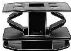
20977 (6G1Z-5410182-A) Gray Nylon

Rocker Panel Moulding Clip Top Head Size: 22mm x 30mm Overall Height: 18mm Ford 500 2005 - On