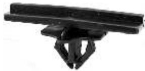
20663 (F57Z-16241-AB, W709767-S300) Black Nylon

Rocker Panel Moulding Clip Head Size: 14mm x 40mm Stem Length: 11mm Ford Mustang 2001 - On