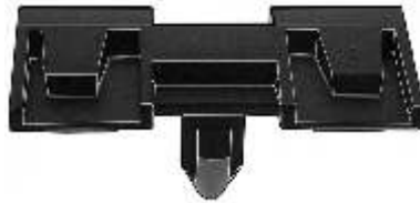
20978 (6G1Z-5410182-B) Gray Nylon

Rocker Panel Moulding Clip Head Size: 22mm x 48mm Stem Length: 14mm Fits Into 9mm Hole Ford 500 2005 - On