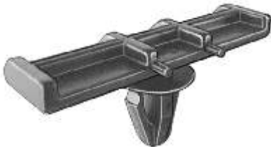
19441 (F1TZ-7810182-A) Black Nylon

Rocker Panel Ground Effects Moulding Clip Explorer, Expedition & F150 1991-On