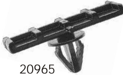
20965 (F4ZZ-6310182-A) Black Nylon

Rocker Panel and Ground Effects Moulding Clip Head Size: 16mm x 50mm Stem Length: 14mm Fits Into 9mm Hole Mustang 1995 - On