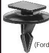
18822 (Ford: KA80-51-RF5A) Nylon

Body Side Garnish Moulding Clip Mazda Millenia & Ford Probe 1995-On