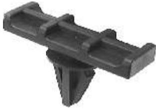
20358 (F6DZ-5410182-AA) Black Nylon

Rocker Panel Moulding Clip Head Size: 13mm x 39mm Stem Length: 14mm Fits Into 9mm Hole Sable, Taurus & Lincoln LS2000 1996 - On