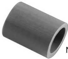
18914 Not Supplied By O.E.M. PVC Plastic

Door Lock Striker Bushing 1/2" I.D., 11/16" O.D. 7/8" Long Ford 1972-On UNIT PACKAGE: 50