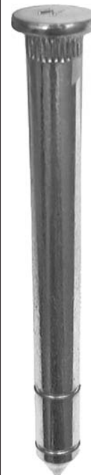
20346 Not Available From O.E.M. Zinc & Yellow

Door Hinge Pin Length: 3-1/2" Pin Dia: 11/32" Knurl Dia: .358" Head O.D.: 9/16"