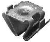
20368 (11517769) Zinc Organic

Door Trim Panel Retainer Nut M6-1.0 Screw Size Buick LeSabre; Cadillac DeVille & Seville; GM C & K Trucks and Oldsmobile Aurora 1999 - On