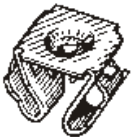
14820 (GM: 14083173, 17988488, 17997722, Ford: N803685S) Phosphate

Dash Panel Nut Screw Size: #8 (M4.2-1.41) GM & Ford 1982-On