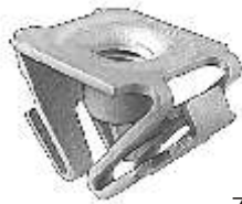
19317 (15707256) Zinc Organic

Looking For A Fastener Not In The Auveco Line? E-mail Your New Item Suggestion To: mail@auveco.com