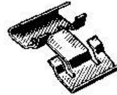
17382 (14100784) Phosphate

Bumper Valance Panel Retainer Cadillac Eldorado & Seville Chevrolet Lumina & Beretta 1987-On