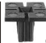
20937 (22546934) Black Nylon

License Plate Screw Grommet M6.3 (#14) Screw Size Head Size: 20mm x 20mm Stem Length: 14mm Buick Skylark, Chevrolet Malibu, Oldsmobile Achieva, Cutlass & Intrigue 1992 - On