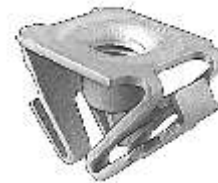
19317 (15707256) Zinc Organic

Front Fender Extension & License Plate Bracket Retainer Nut M6-1.0 Screw Size GM Express & Savanna 1996-On