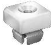
19485 (6027958) Natural Nylon

1/4" (#14) Screw Size License Plate Nut Chrysler