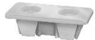
21014 (10266978) White Nylon

License Plate Screw Grommet #14 (M6.3) Screw Size Head Size: 17mm x 33mm Stem Length: 9mm GM 1997 - On