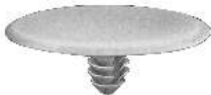
19384 (QL77SJJ) Light Silver Fern Nylon Headliner Retainer Chrysler Caravan, Voyager and Town & Country 1997-On UNIT PACKAGE: 25

Refer to Retainer Specification Chart on pages 390 - 397