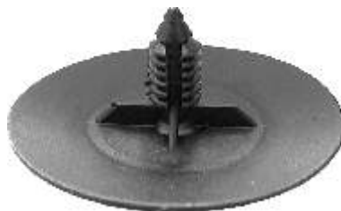
11130 (3078511, 3977775) Black Nylon Hood Insulation Retainer GM 1964-On UNIT PACKAGE: 25