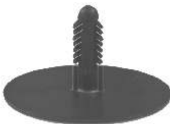
16863 (N803613S) Black Nylon Hood Insulation Retainer Ford Bronco, Explorer & Ranger 1988-On UNIT PACKAGE: 25