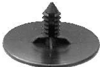
15456 (20064875) Black Nylon Hood Insulation Retainer GM 1980-On UNIT PACKAGE: 25