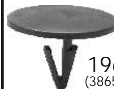
19655 (386553-S) Black Nylon Hood Insulation Retainer Ford 1975-On Replaces Auveco 13571 UNIT PACKAGE: 25