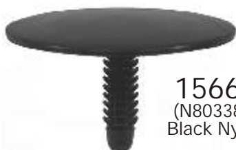
15668 (N803387) Black Nylon Trim Panel Retainer Ford UNIT PACKAGE: 25