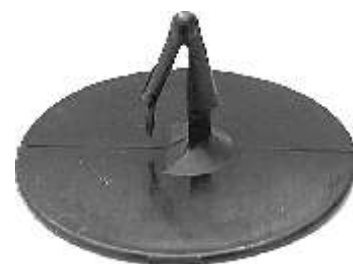
14163 (388908-S) Black Nylon Hood Insulation Retainer Ford 1975- On UNIT PACKAGE: 50