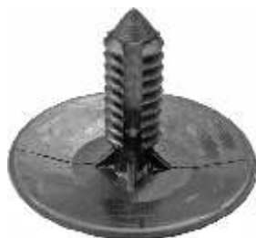
15457 (20030401) Black Polypropylene Hood Insulation Retainer GM 1980-On UNIT PACKAGE: 25