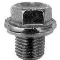
20426 (90009-PY3-000) Zinc & Yellow With Aluminum Gasket

Thread: M14-1.5 Hex: 17mm Length Under Head: 15mm Washer Head O.D.: 24mm