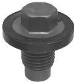
18374 (F5AZ-6730) Plain With Rubber Washer Face Gasket

Thread: M12-1.75 Hex: 15mm Length Under Head: 21mm Rubber Gasket O.D.: 28mm