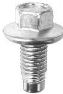
21047 (GM: 3536964, 3538469, 11519408, 11562588, 24100042; Isuzu: 8-11519-408-0) Zinc With Rubber Gasket

Thread: M12-1.75 Hex: 15mm Length: Under Head: 25mm Washer Head O.D.: 26mm