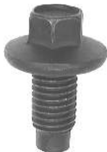
20347 (YS4Z-6730AA) Plain With Rubber Gasket

Thread: M12-1.75 Hex: 13mm Length Under Head: 25mm Washer Head O.D.: 26mm Fits the following applications: Ford 1999 - 93