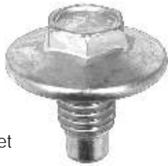
21093 (24233099) Zinc With Rubber Gasket

Thread: M12-1.75 Hex: 15mm Length: Under Head: 20mm Washer Head O.D.: 32mm