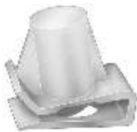
19809 (650870AA) Natural Nylon

#8 (M4.2) Screw Size Panel Range: 1mm-4.25mm Center Of Hole To Edge: 10mm Chrysler